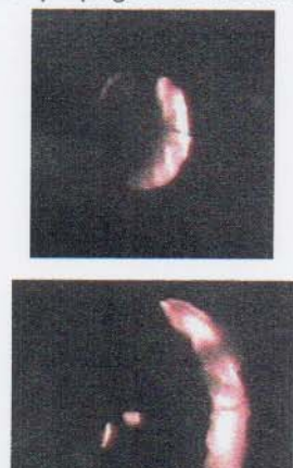
Fig. 2 (a) Glowing firebrand, d_0 = 25 mm (b) Glowing firebrand, d_0 = 50 mm.

results obtained for single glowing firebrand impact into pine needle beds is displayed in table 1. Each result was based on identical, five repeat experiments. The acronym NI denotes no ignition. For the firebrand sizes tested and the experimental combination tested, it was not possible to ignite pine needle beds from single glowing firebrand impact. After the firebrand impacted the pine needle bed, one or two needles would smolder and the smolder front would not propagate further in the bed.